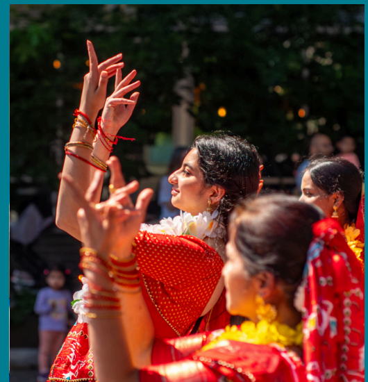
Dancers in the Grand Parade