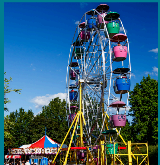
Ferris wheel at Derby Days