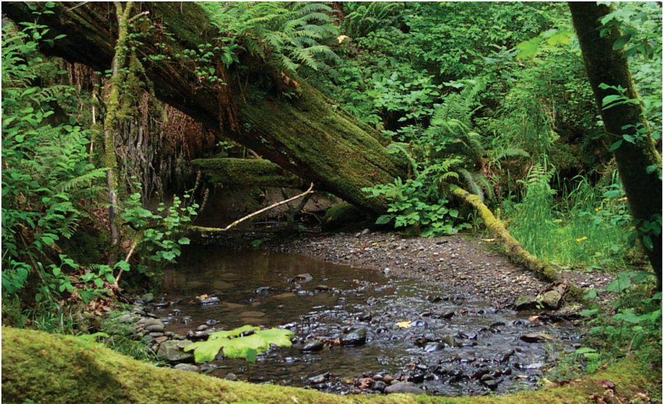
Peters Creek in Redmond