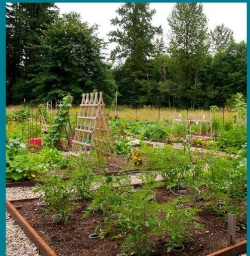
Juel Community Gardens