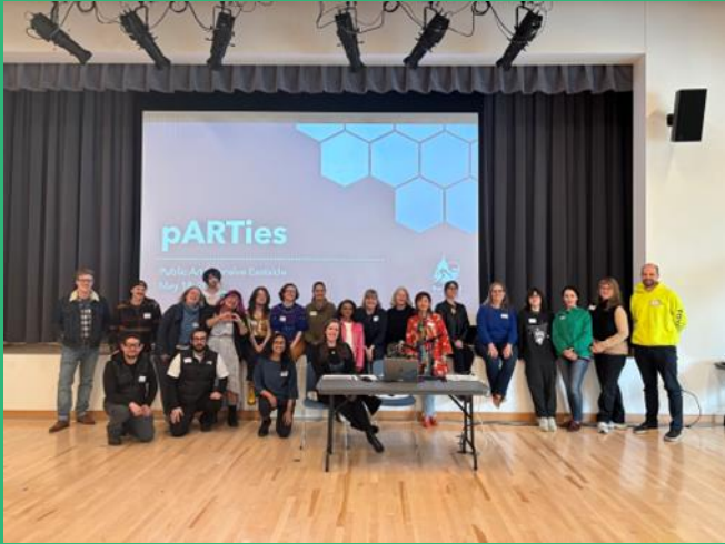
2024 Public Art Intensive Eastside cohort