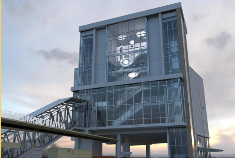
Marymoor Village Station, Nova Jiang