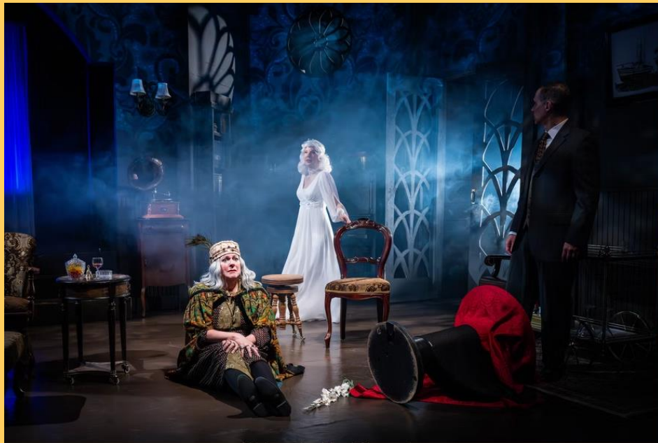
Blithe Spirit at SecondStory Repertory