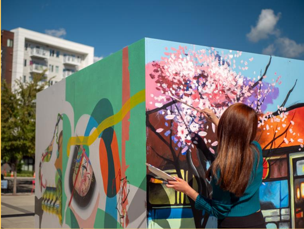
Eastside in Spring by Sasha Tai, Downtown Redmond Art Walk