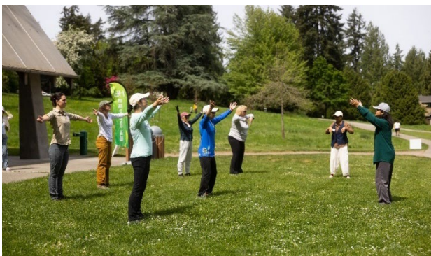
Figure 1: Tai Chi session following park restoration at the United Hub x Green Redmond event.