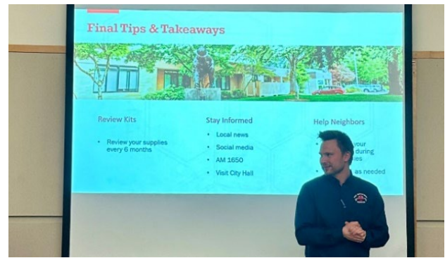
Figure 2: Emergency Preparedness discussion with Redmond Climate Action Group at Redmond Library.