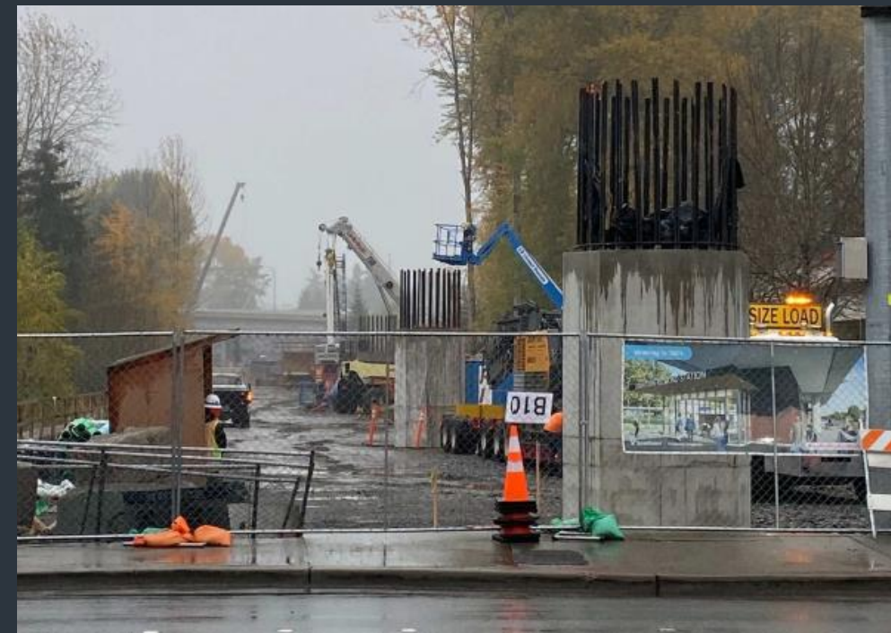
Elevated guideway east of 166 th Ave. NE