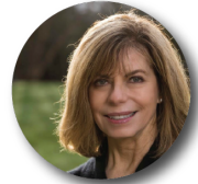
Mary Morrow Nelson Legacy Group