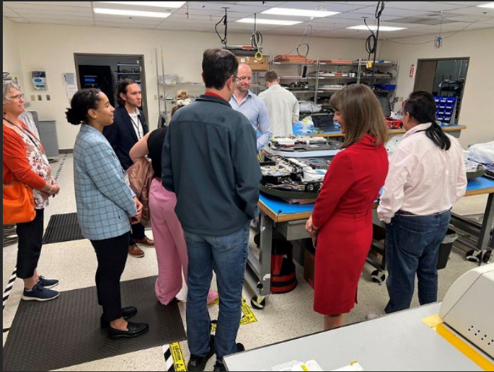
Tour of Kymeta during Redmond Seattle Space Week event in June 2024.