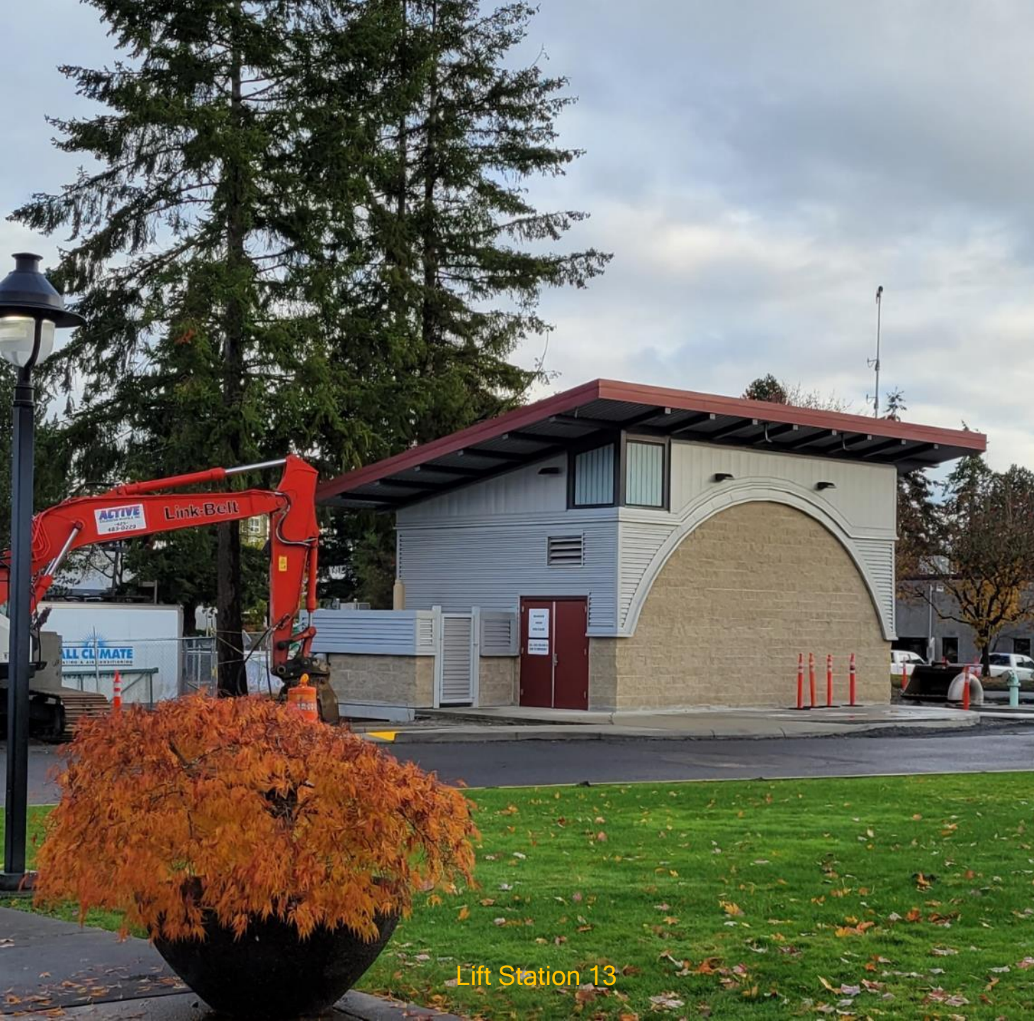
Lift Station 13