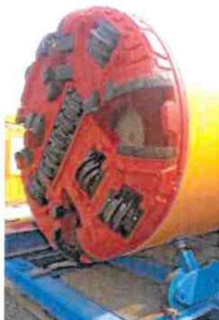
We will use microtunneling to cross under the Sammamish River.