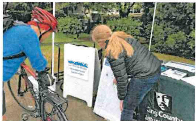
Member of the project team sharing information at Bike Everywhere Day in 2018.