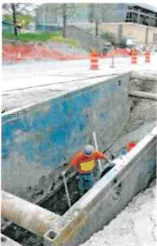
An example of open-trench construction.

Where necessary, a trenchless method will be used to protect environmentally sensitive areas, such as when the pipe crosses under the Sammamish River.