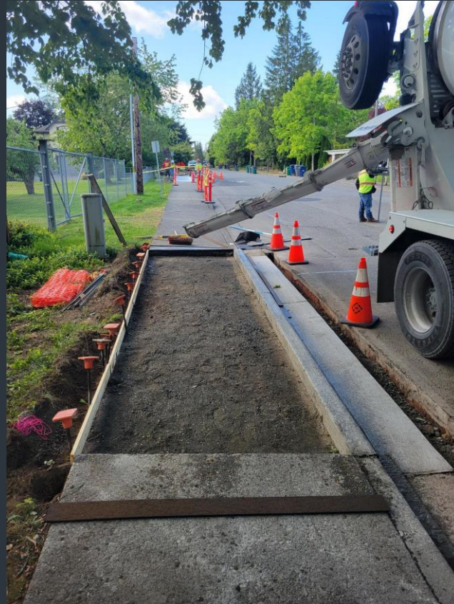
Concrete repairs at NE 60 th St