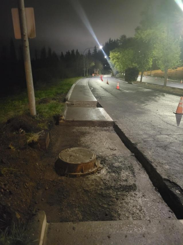
Concrete repairs at ESLP