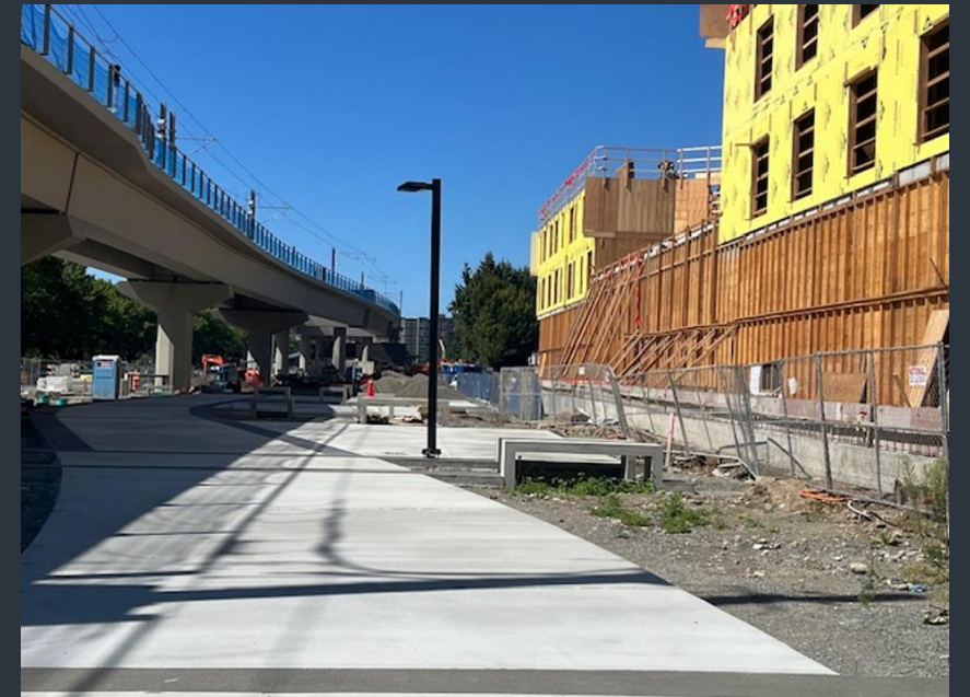
Redmond Central Connector