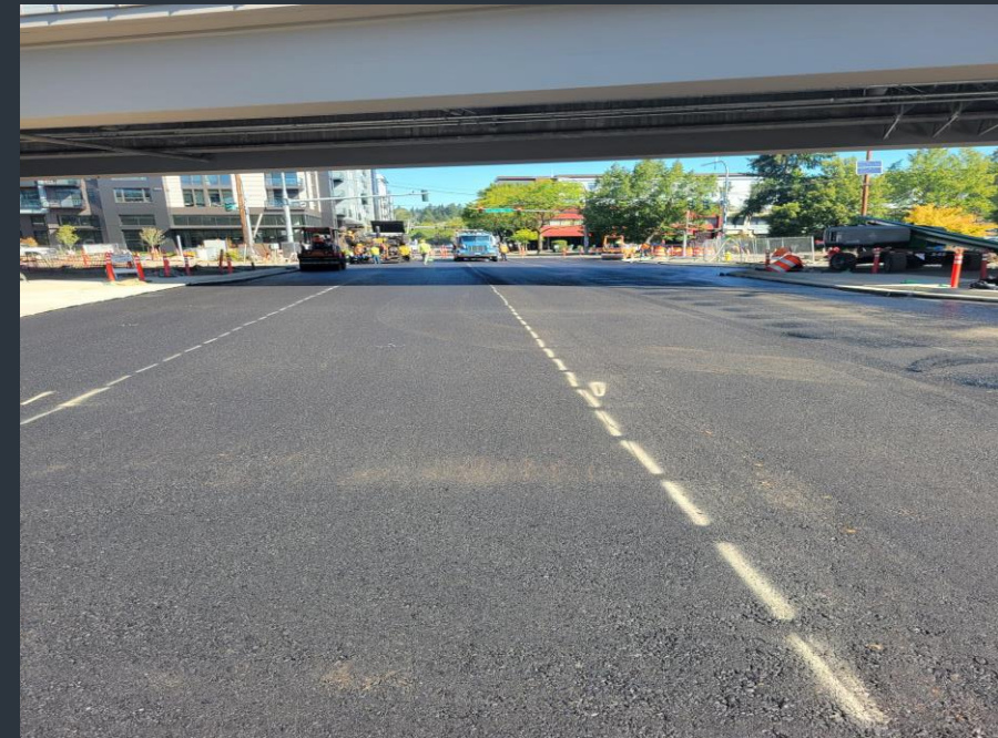
Paving at NE 76 ST