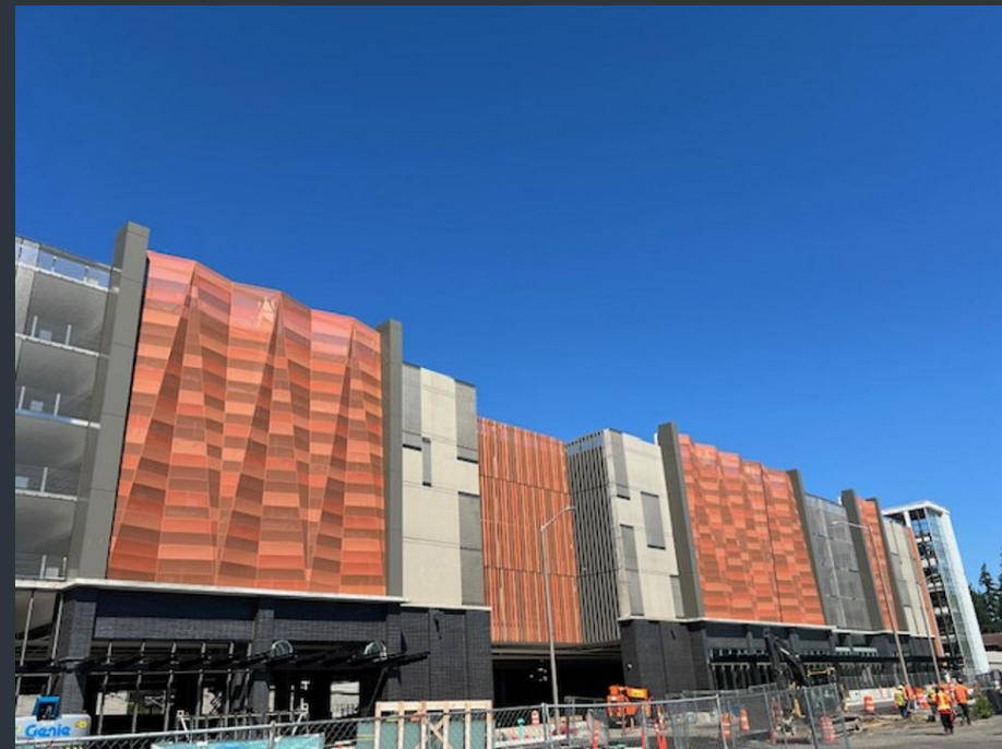
Marymoor Station Garage