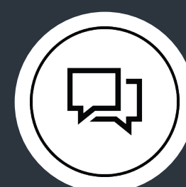
Let's Connect and social media