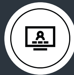
Virtual Community Meeting