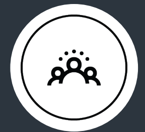
Focus Group Meetings