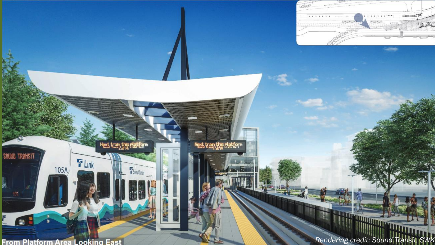
From Platform Area Looking East