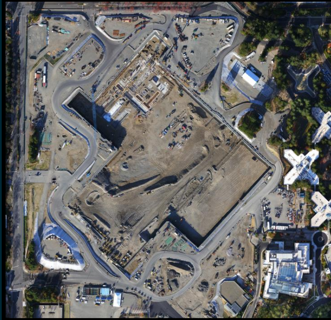
Skycatch photograph November 2, 2019