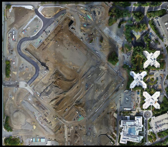
Skycatch photograph Sept 16, 2019