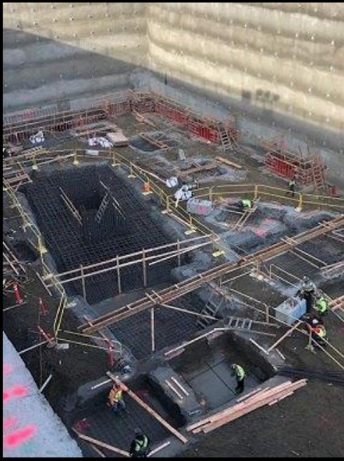
Rebar for Plaza Elevator Pit