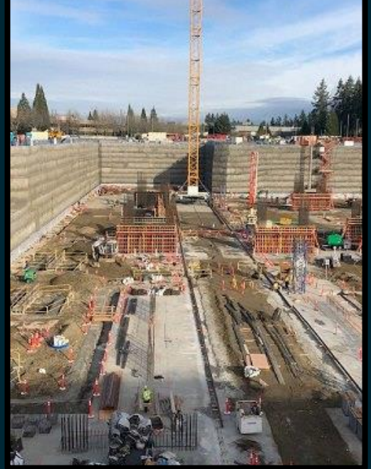
Shear Wall Footings