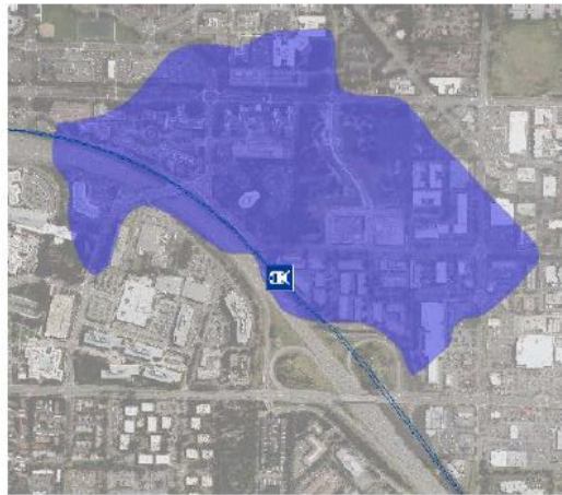
Without Overlake Village Pedestrian Bicycle Bridge (Blue Area)