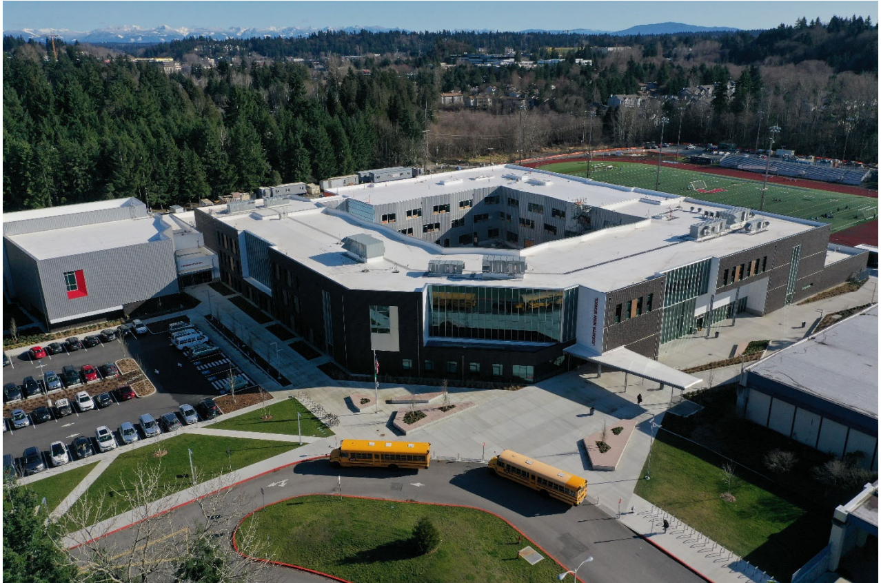
Juanita High School – Phase II To Open Fall 2020