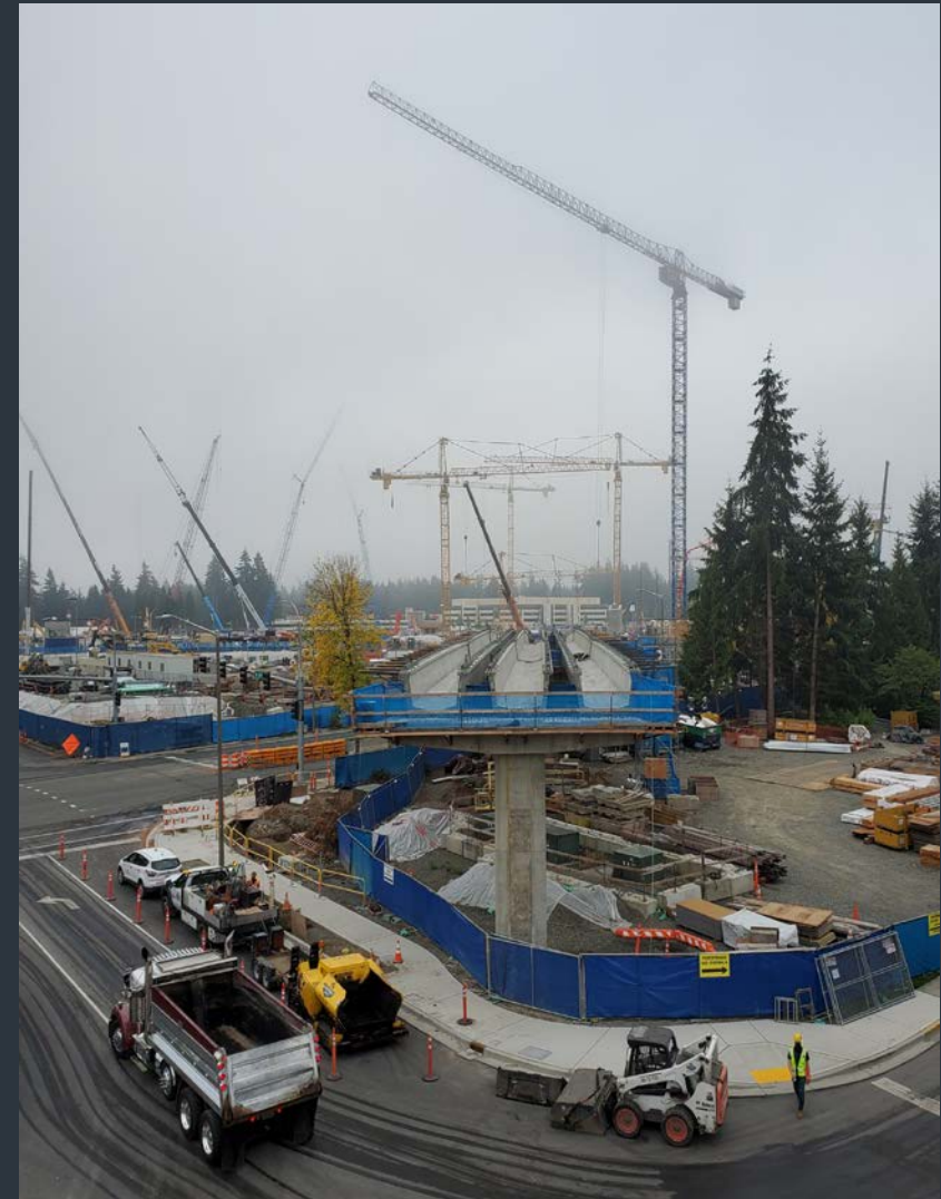
Looking east from the corner of NE 36 th /Augusta Drive towards Microsoft's East Campus