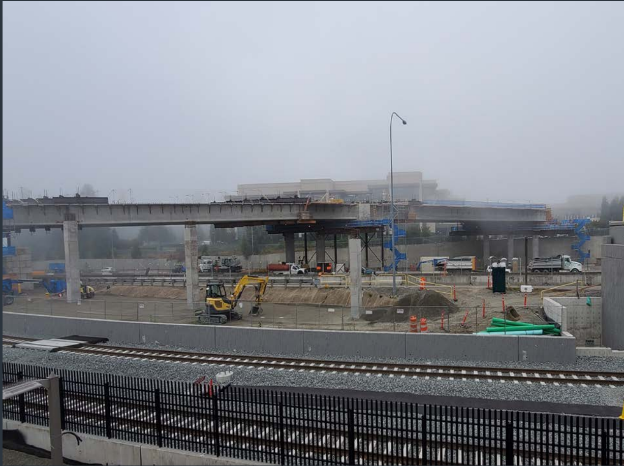
Direct Access Ramp abutment and columns across the tracks, looking west from RTS Garage ramp