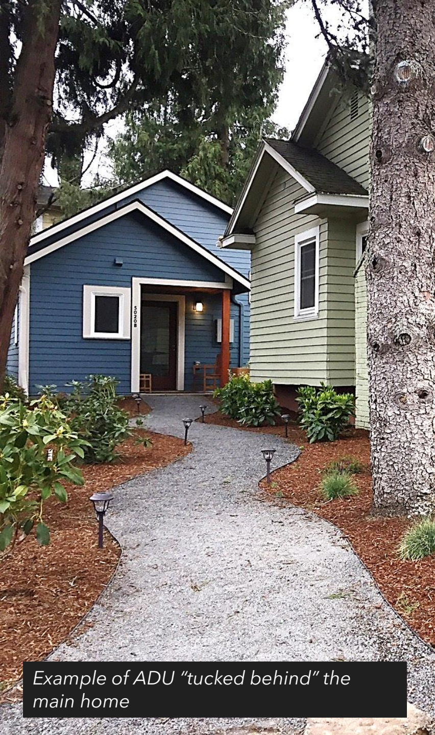
Example of ADU "tucked behind" the main home