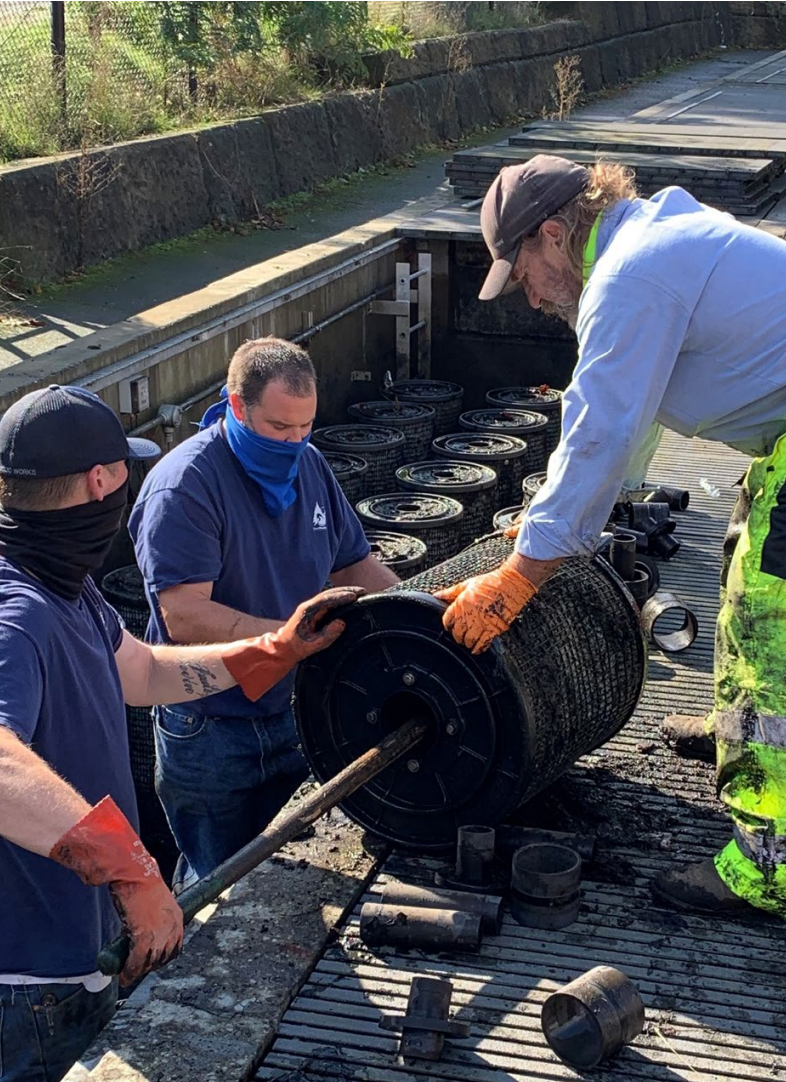
Stormwater crew members perform regular maintenance on the Redmond Way Water Quality Facility.