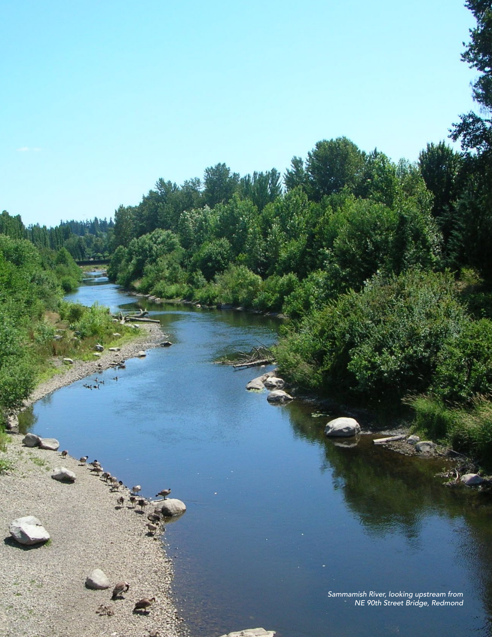
Sammamish River, looking upstream from NE 90th Street Bridge, Redmond