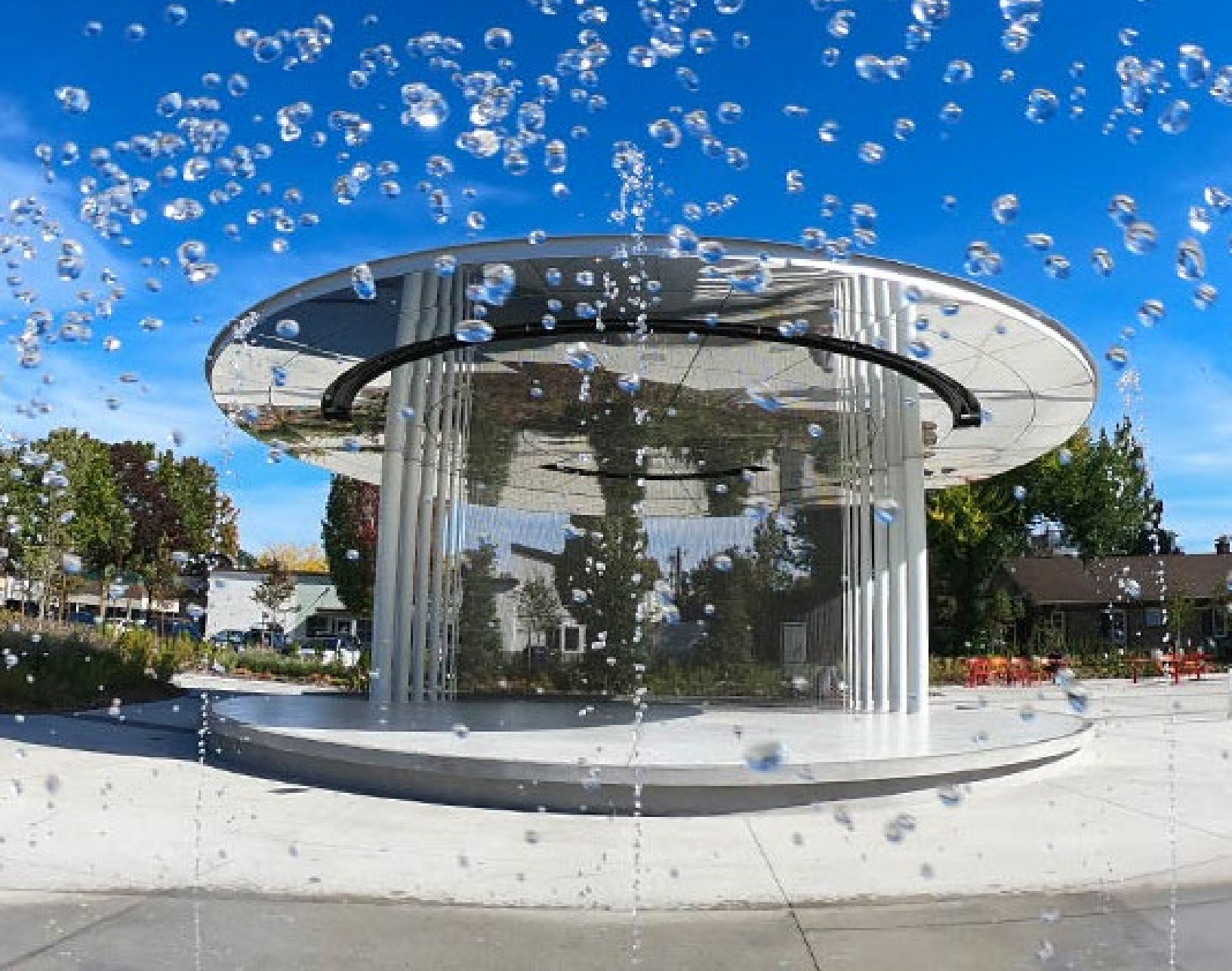
Downtown Park, Redmond