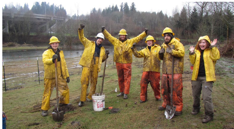
Washington Conservation Corps members conduct streambank restoration work.