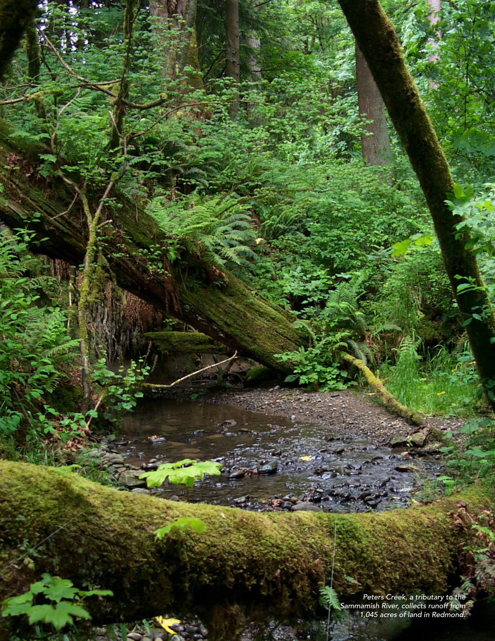
Peters Creek, a tributary to the Sammamish River, collects runoff from 1,045 acres of land in Redmond.