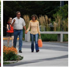
RCC, PHASE II

The RCC is being built in three phases, from the East Lake Sammamish Trail to the Cross Kirkland Corridor. The first two phases have been built and are being enjoyed by tens of thousands of people a month. The final phase, RCC III, will be designed and constructed once funding is available. Our partner Puget Sound Energy plans to build a maintenance access road with the City building the 1.6 miles of trail on top of that access road. The RCC is part of the Eastrail regional partnership between Redmond, Kirkland, Woodinville, King County, Sound Transit, and Puget Sound Energy to redevelop the 42-mile rail-banked corridor between Snohomish County and Renton into an expanded regional trail and transit system, and accommodate regional utilities.