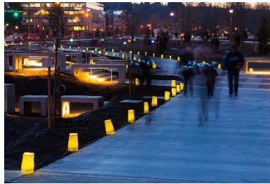
RCC, PHASE I

Redmond invested $11.35 million in 2010 to secure four miles of the rail-banked former Burlington Northern Santa Fe rail corridor, known as the Eastside Rail Corridor (Eastrail) and buy adjacent properties to accommodate the intended uses. The trail was designed as a linear park with integrated art, spaces for gathering and events, mid-block connections, safety improvements at intersections and a paved trail.