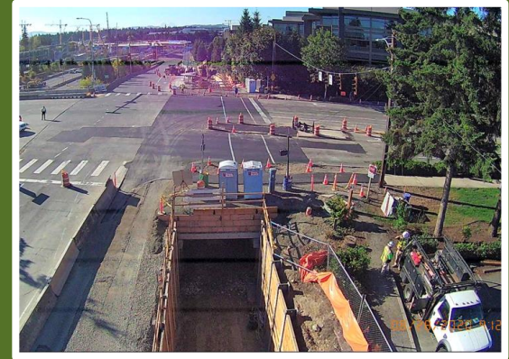
Grade Separation construction