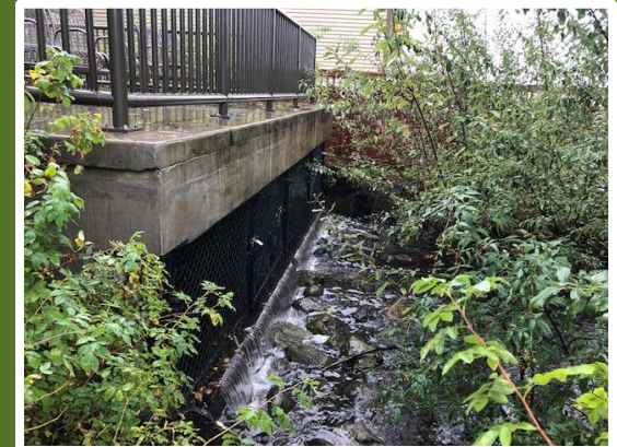
Storm Trunk flow control