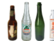
BOTTLES / बोतलें