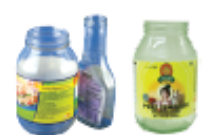
JARS / जार