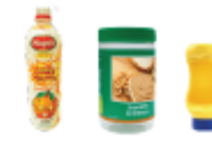
BOTTLES / बोतलें