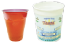
CUPS & TUBS / कप और टब