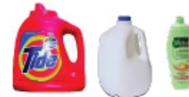
JUGS / जग