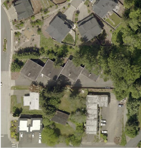
Aerial view of Fireside Apartments