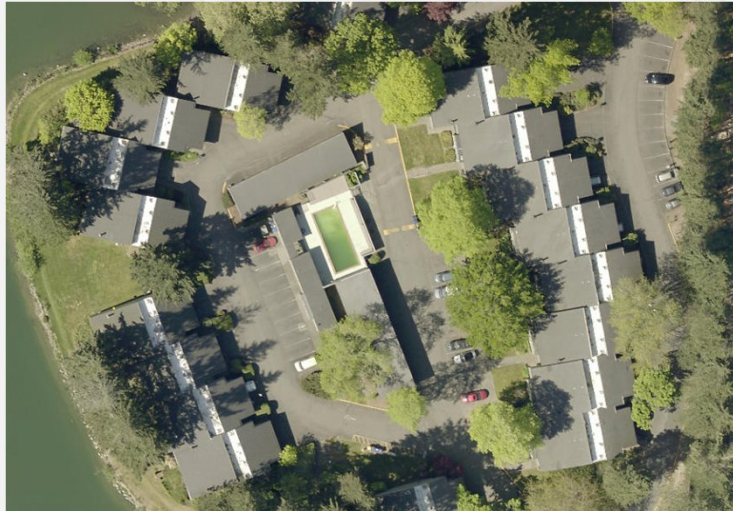
Aerial view of Sixty-01 Village